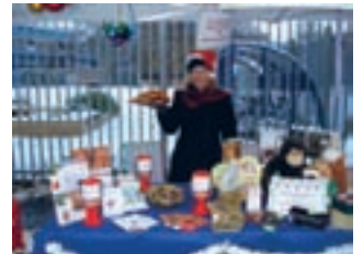
Tesco's Xmas Fayre!

opportunity of taking part in such a community spirited venture. Lots of hard work, but really worth it to see all those lovely smiles on all those children's faces.