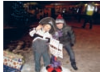
Parker & North's Xtrafactor audition