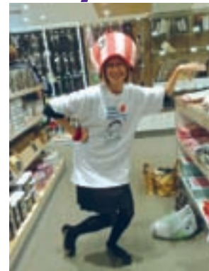
I'm a little teapot!

And if you think you can beat our "I'm a little teapot" photo shoot, do please send your photos in for publication in our next Newsletter!